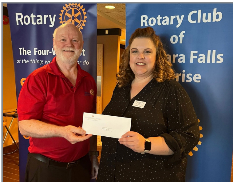
The Rotary Club of Niagara Falls Sunrise made a donation which will fund the purchase of a new Stryker S3 bed!