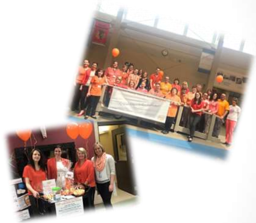
Rankin Run Fundraiser – “Orange Day!”