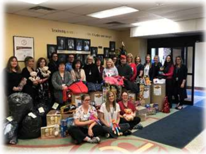
Community Care Christmas Drive

We extend our helping hands and hearts as we strive to provide holistic care to those in need