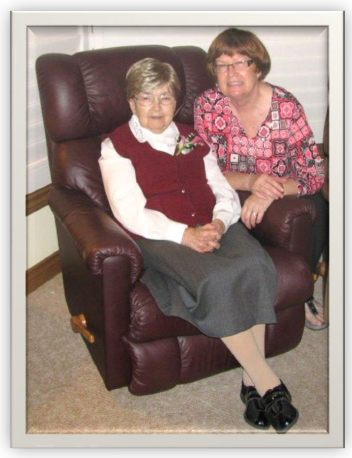
Comfort. Care. Hope.