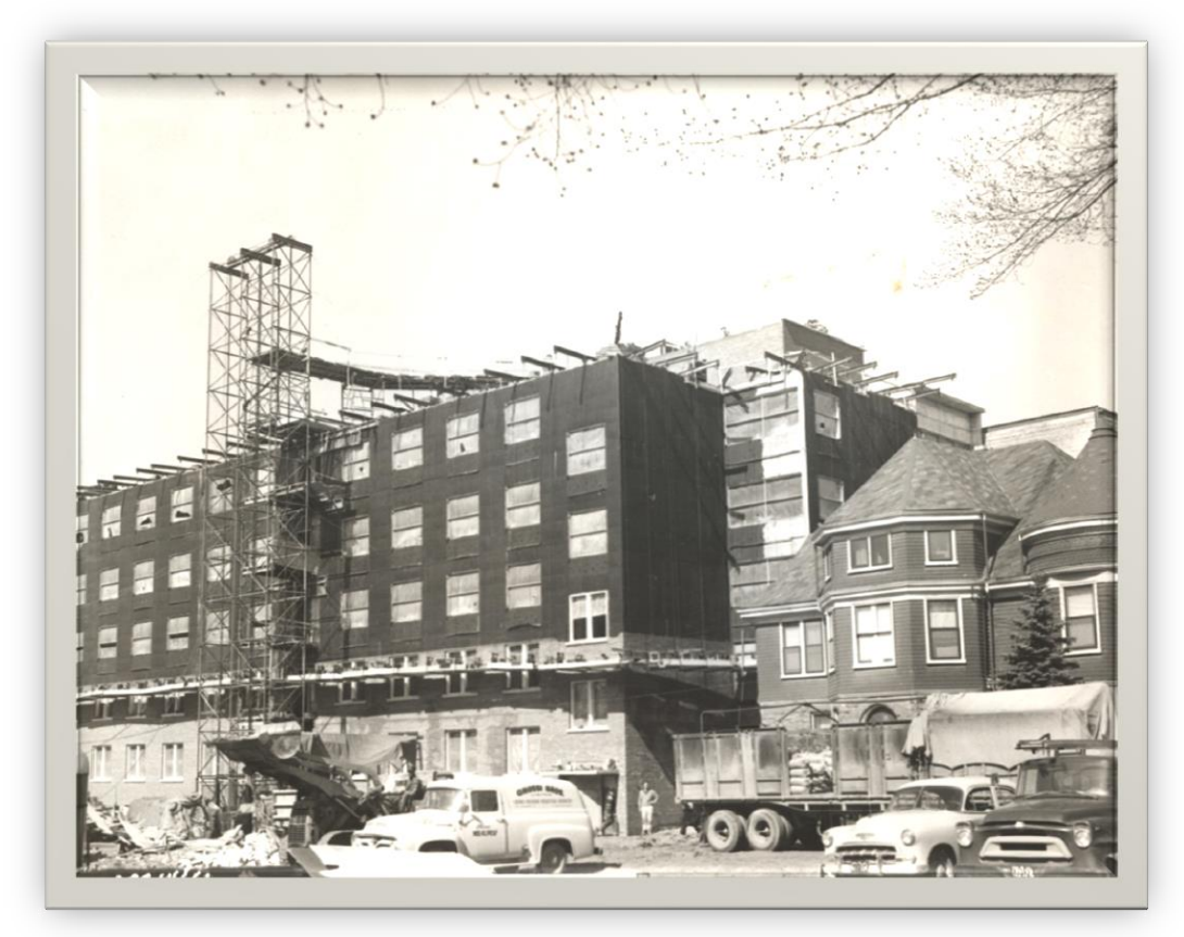
Comfort. Care. Hope.