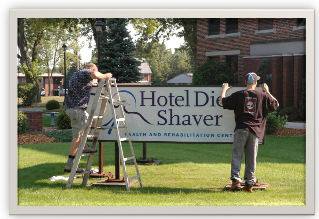
Comfort. Care. Hope.

On August 8, 2005 as a result of a local solution to hospital restructuring in St. Catharines, the Hotel Dieu Health Sciences Hospital, assumed governance and management of the Shaver Hospital and Niagara Rehab Centre.