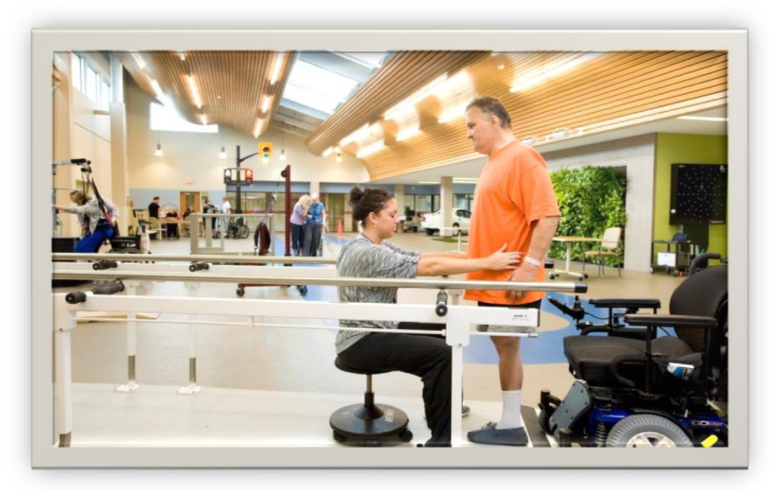
Comfort. Care. Hope.

In 2012, Hotel Dieu Shaver Health and Rehabilitation Centre proudly announced the opening of the Centre's new 5,700 square foot rehabilitation area, affectionately known as the 'Courtyard'.