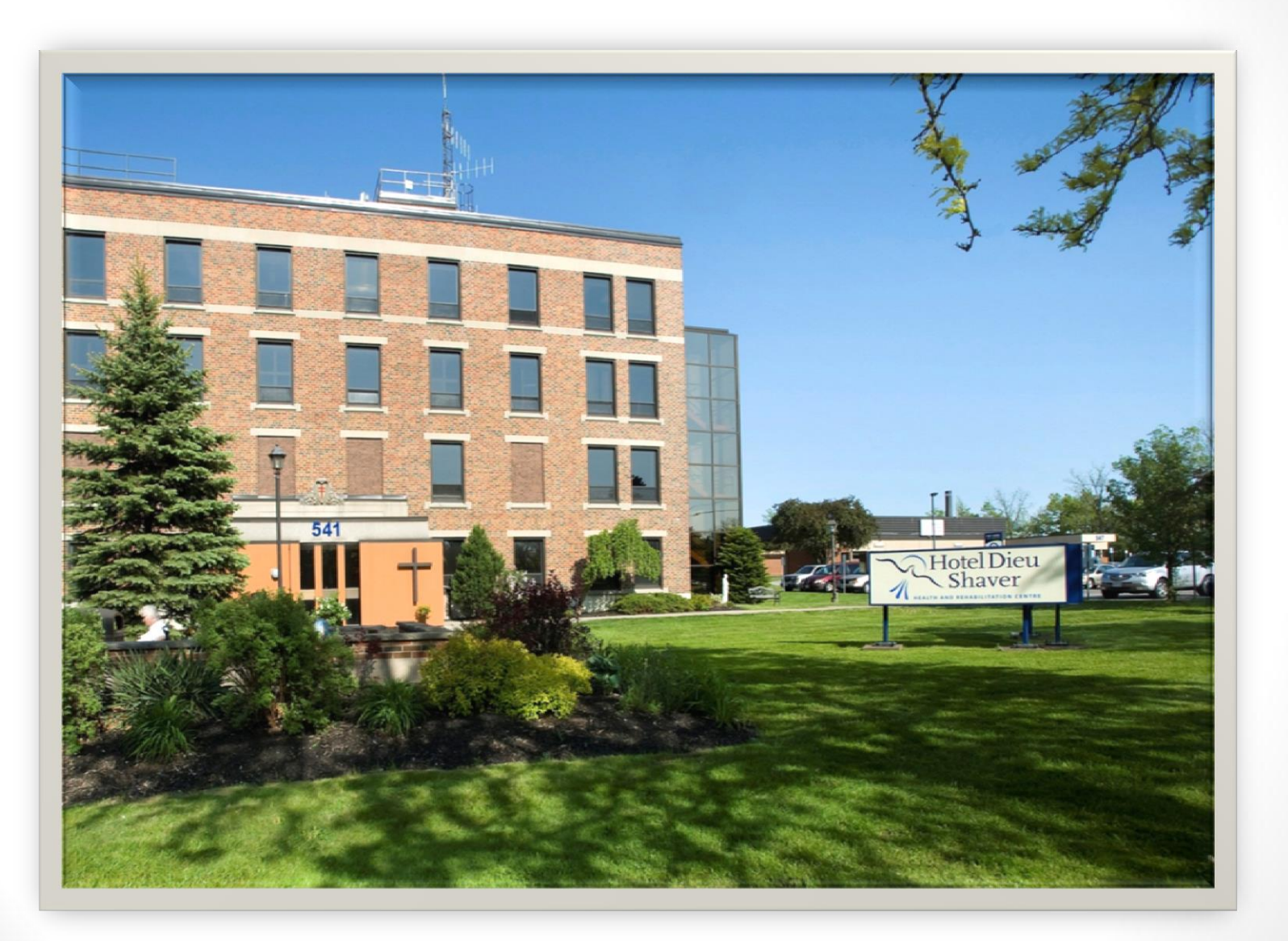
Comfort. Care. Hope.